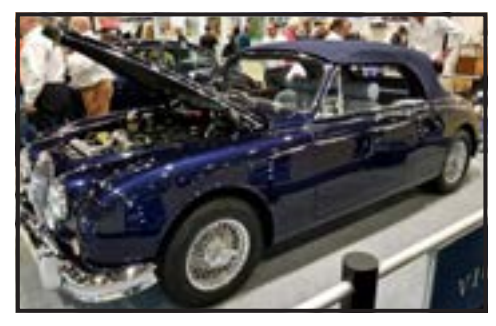
A very rare Mark II convertible