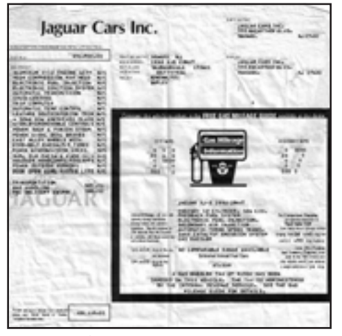
Pix of XJS sticker labeled: XJS

I learned that if he had a car's VIN he could find what options had been offered or included. But, fortunately for me, I had a copy of the actual vehicle invoice from the dealer and it contained all the details and relevant information about my XF. So, I sent it and approximately two weeks later a package arrived inside of which was a laminated sticker and an un-laminated one. The new window sticker looks great and even has some crease marks as if it had been folded.