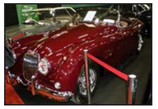
An XK150 OTS