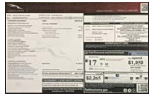
Pix of XF window sticker labeled: After

So, if you think you might like a really well done, reproduced, window sticker you can contact Howard Meyers at WindowStickers100@aol.com. The price is $35 and will include one laminated and one un-laminated sticker. If you don't have any information about your car, he can use the VIN to obtain information and then either use a picture of your car or information you send him, to fully develop the sticker. Otherwise, you may be able to get useable information from the Jaguar Heritage Trust (www.jaguarheritage. com/archive-services/certificates/).