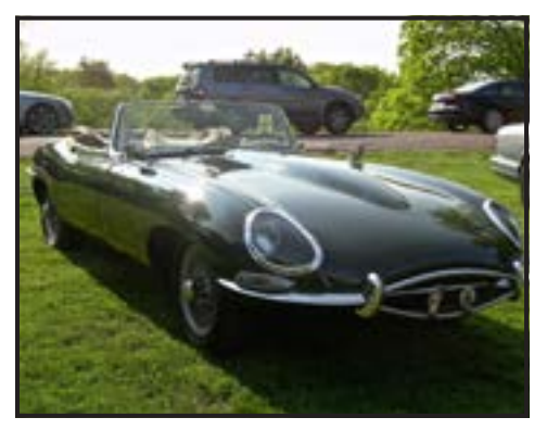
(Continued on page I3) June 2019