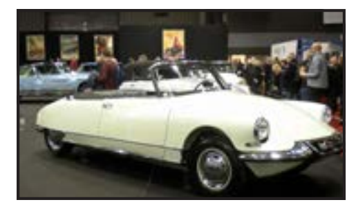
1965 Citroen DS21 Cabriolet by body designer Chapron