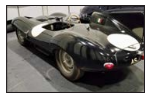
A Jaguar C-Type after a quick run down Grand Avenue