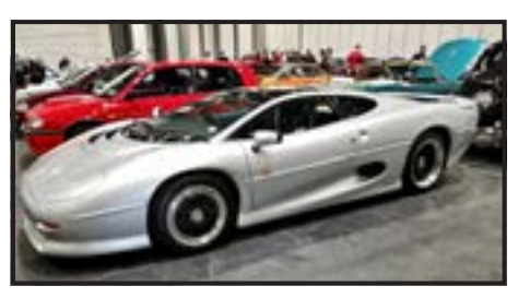
An XJ220 (sigh!)