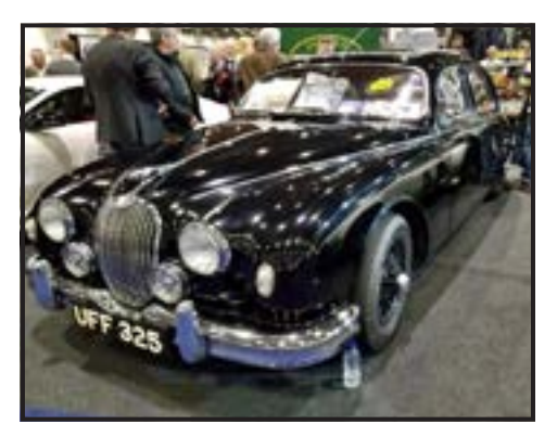
Inspector Morse's first Jag

There were many cars for sale. A 1928 Rolls Royce Phantom 1 was listed for 120,000-140,000 pounds. For 8,000 -10,000 pounds you could be the proud owner of a 1968 Jaguar 420G Estate. And a 1979 Bentley T2 cost only 110,000 - 130,000 pounds. Finally, a 1986 Jaguar XJ-S could be purchased for 10,000 - 15,000 pounds.