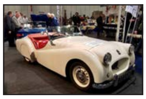
The first pre-production right-hand drive TR2 from 1953