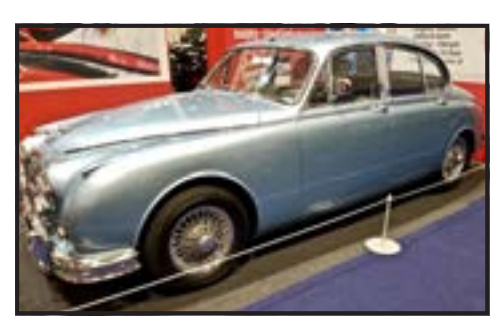
A lovely light blue Jaguar Mark II