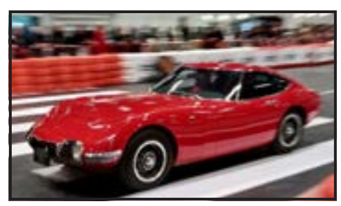
A rare Toyota 2000 GT on the show track, also known as Grand Avenue, where you could see and hear the cars in action.

There were many cars for sale. A 1928 Rolls Royce Phantom 1 was listed for 120,000-140,000 pounds. For 8,000 -10,000 pounds you could be the proud owner of a 1968 Jaguar 420G Estate. And a 1979 Bentley T2 cost only 110,000 - 130,000 pounds. Finally, a 1986 Jaguar XJ-S could be purchased for 10,000 - 15,000 pounds.